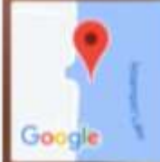
Kombakkam, Puducherry, India கம்பக்கம் கிழவாசல் காலநிலை மையம், Kombakkam, Puducherry 605110, India Lat 11.910605° Long 79.796928° 07/10/22 02:42 PM