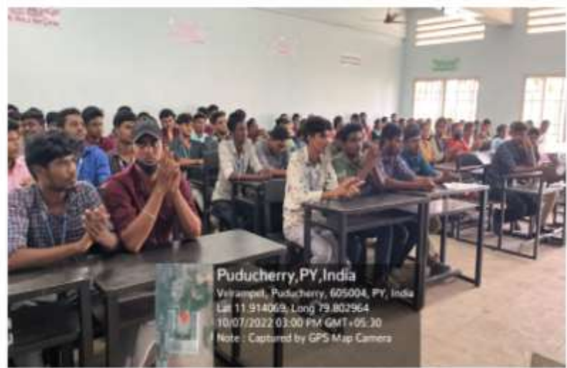
Puducherry, PY, India Velampet, Puducherry, 605004, PY, India Lat 11.914069, Long 79.802964 10/07/2022 03:00 PM GMT+05:30 Note : Captured by GPS Map Camera