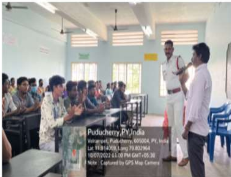
Puducherry, PY, India Velampet, Puducherry, 605004, PY, India Lat 11.914069, Long 79.802964 10/07/2022 03:00 PM GMT+05:30 Note : Captured by GPS Map Camera